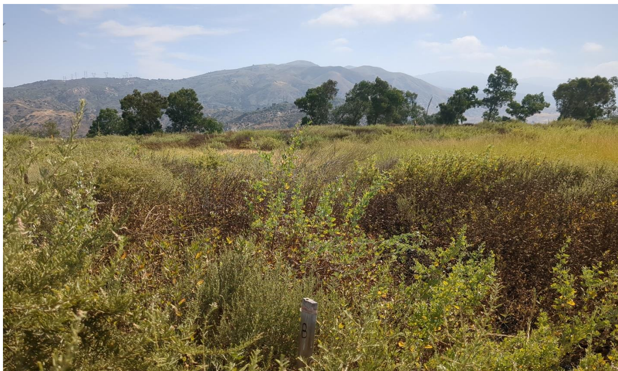
Photograph 2. Quadrat B facing northeast from southwest corner (June 23, 2025).