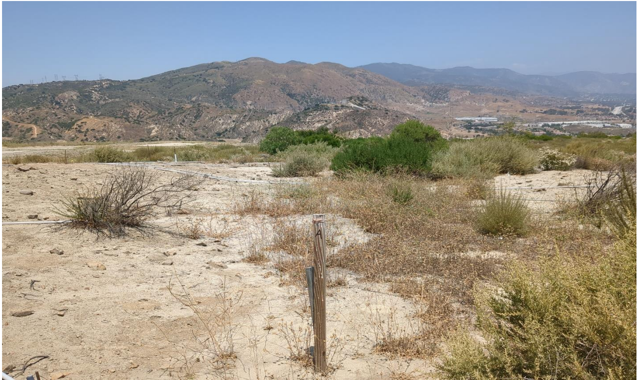
Photograph 1. Quadrat A facing northeast from southwest corner (June 23, 2025).