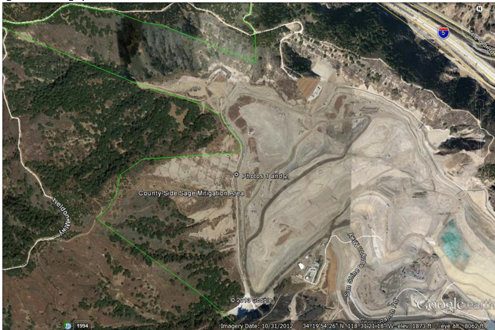
Figure 1 Photograph Locations