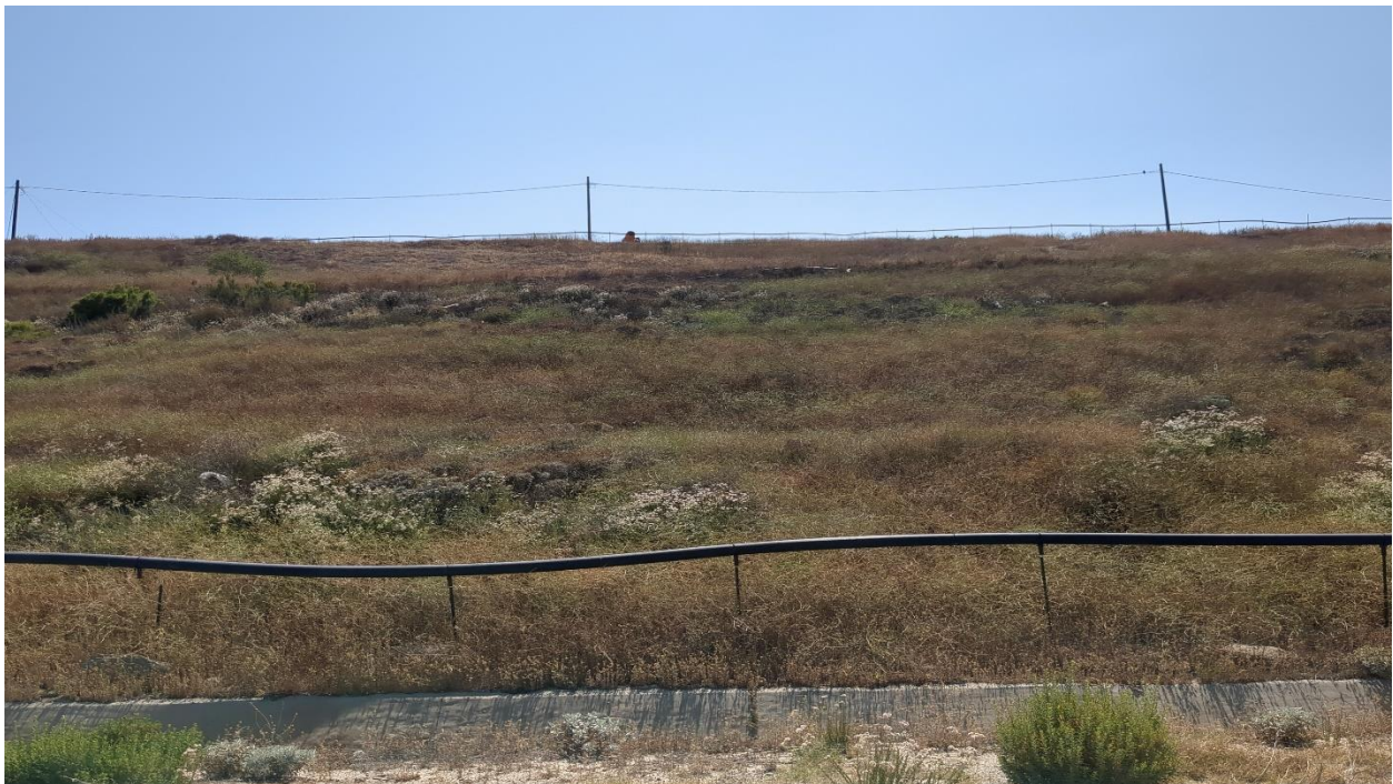
Photograph 4. Facing west at the easterly-facing slope located between the Middle and Upper decks. The vegetation on the slopes between the Middle and Upper Deck is dominated by California buckwheat (currently flowering) and non-native annual grasses (June 23, 2025).