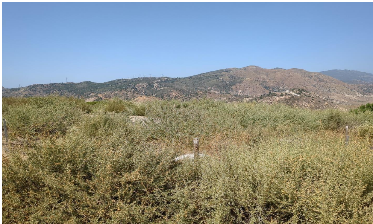
Photograph 7. Quadrat G facing northeast from southwest corner (June 23, 2025).