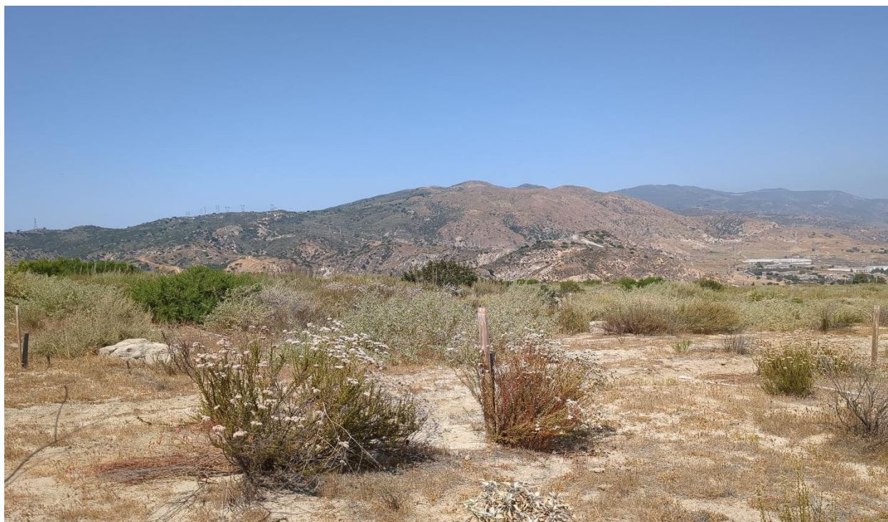
Photograph 6. Quadrat F facing northeast from southwest corner (June 23, 2025).