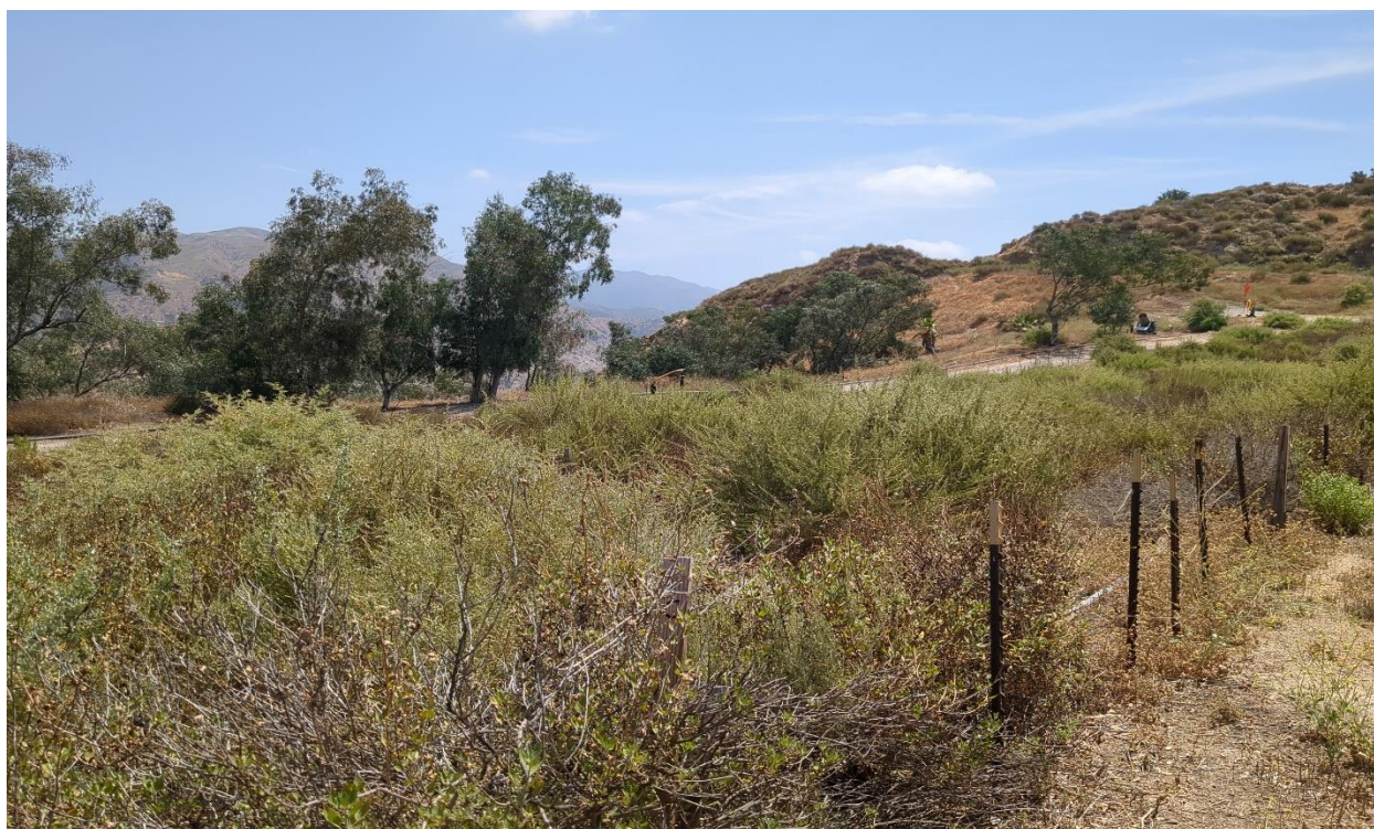
Photograph 3. Quadrat C facing northeast from southwest corner (June 23, 2025).