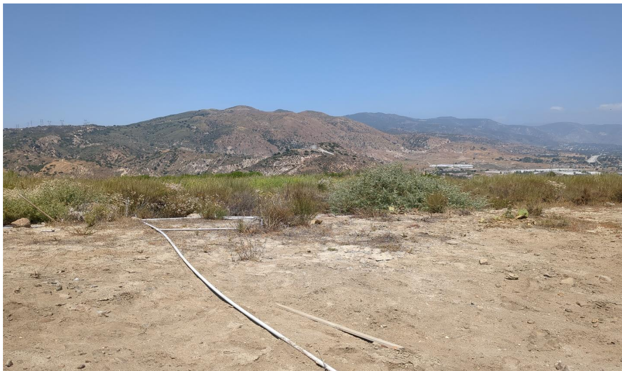
Photograph 3. Quadrat C facing northeast from southwest corner (June 23, 2025).