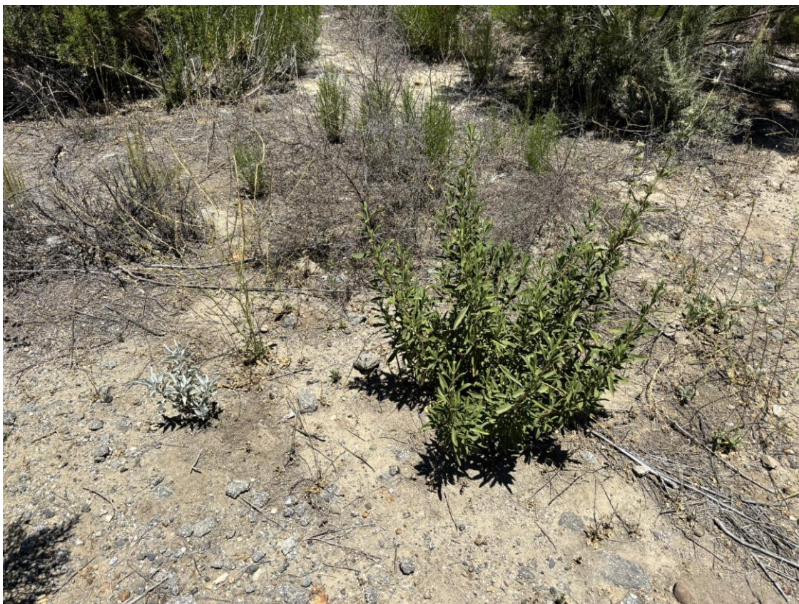
New Venturan CSS species growing within previous barren area on Deck B