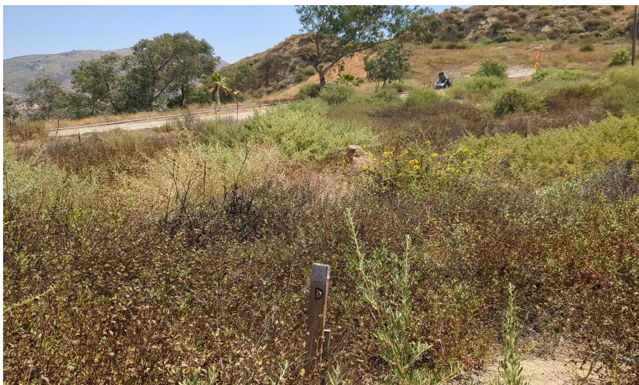
Photograph 4. Quadrat D facing northeast from southwest corner (June 23, 2025).