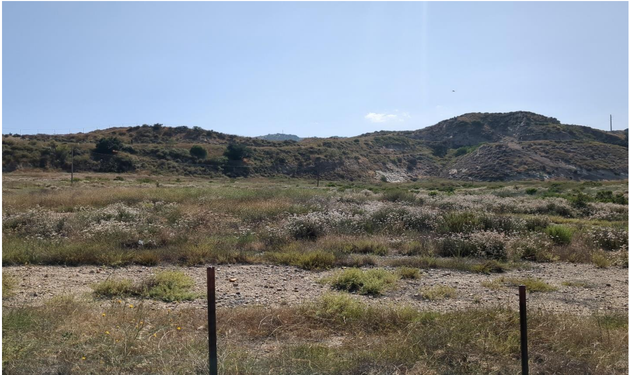
Photograph 7. Facing southeast at the western portion of the Upper Deck. This area is dominated by short podded mustard, Australian saltbush, and California buckwheat (June 23, 2025).