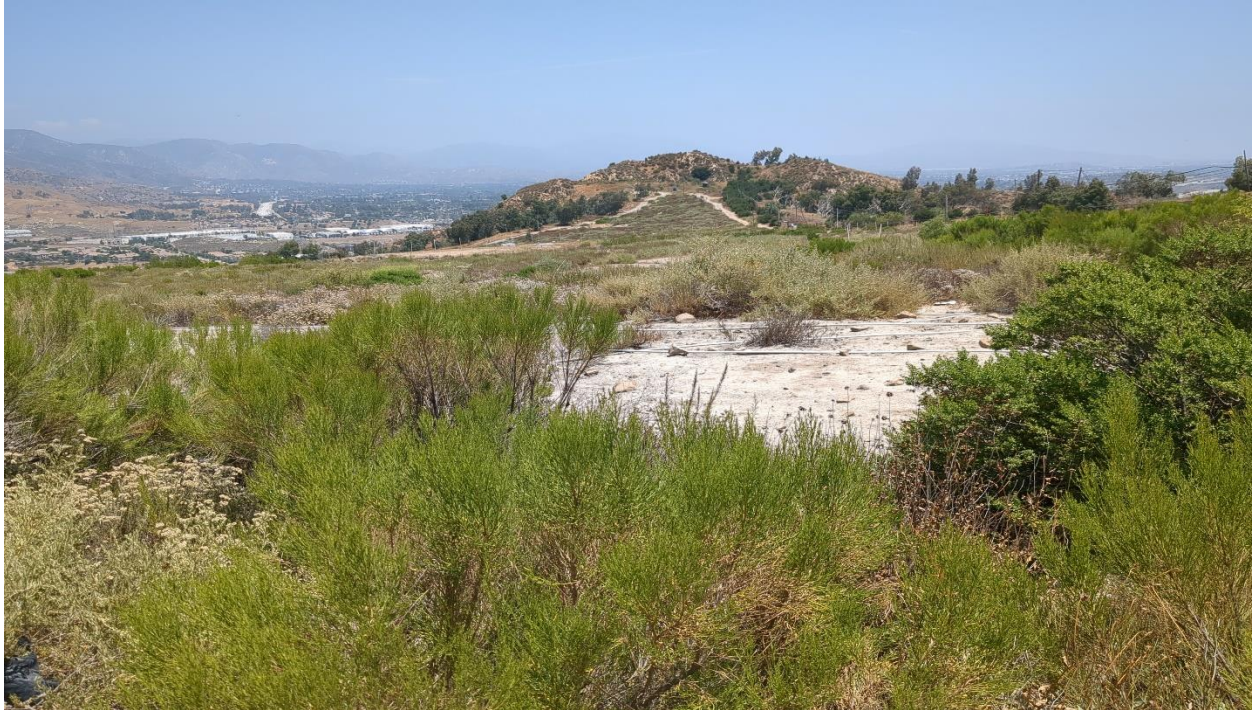
Photograph 3. Facing east at the Middle Deck from western boundary (June 23, 2025).