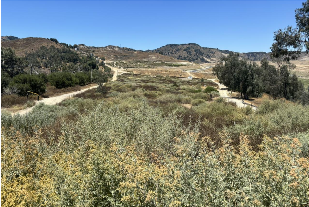
Mosaic of actively growing Venturan CSS and those going through summer dormancy