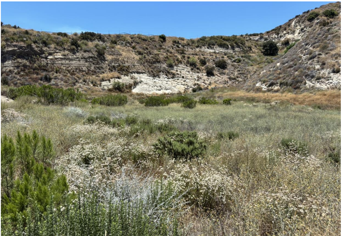
Deck A Venturan CSS intermixed with weeds on south side of the Deck