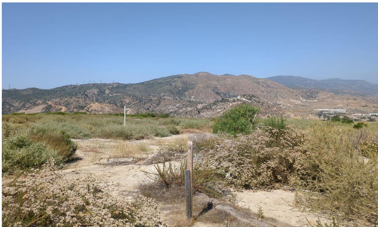
Photograph 8. Quadrat H facing northeast from southwest corner (June 23, 2025).