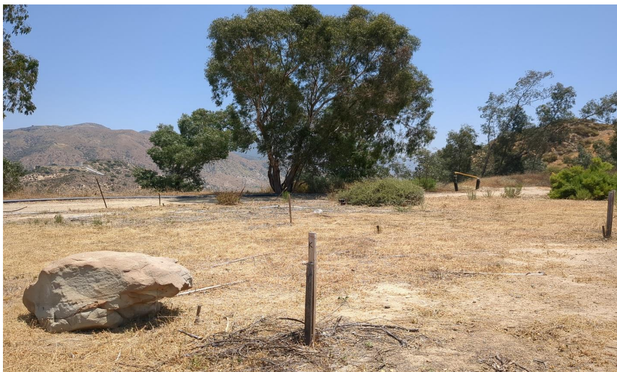
Photograph 11. Quadrat K facing northeast from southwest corner (June 23, 2025).