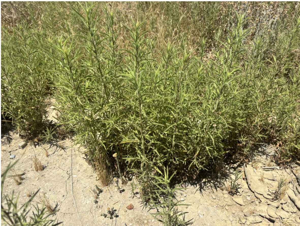
Sinkwort actively growing on Deck C