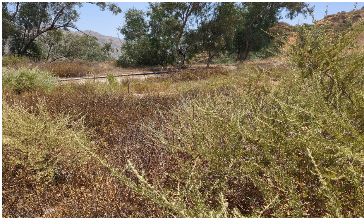
Photograph 12. Quadrat L facing northeast from southwest corner (June 23, 2025).