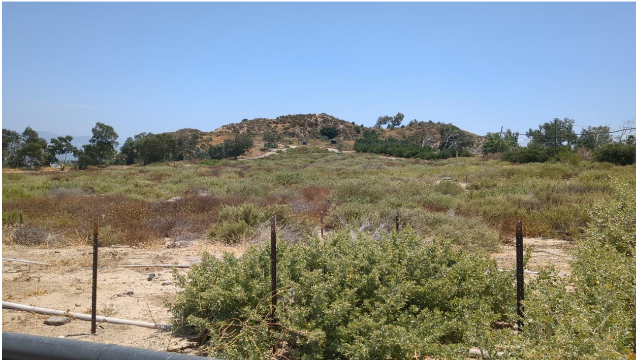
Photograph 2. Lower Deck from western boundary (June 23, 2025).