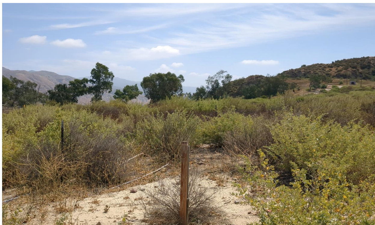
Photograph 6. Quadrat F facing northeast from southwest corner (June 23, 2025).