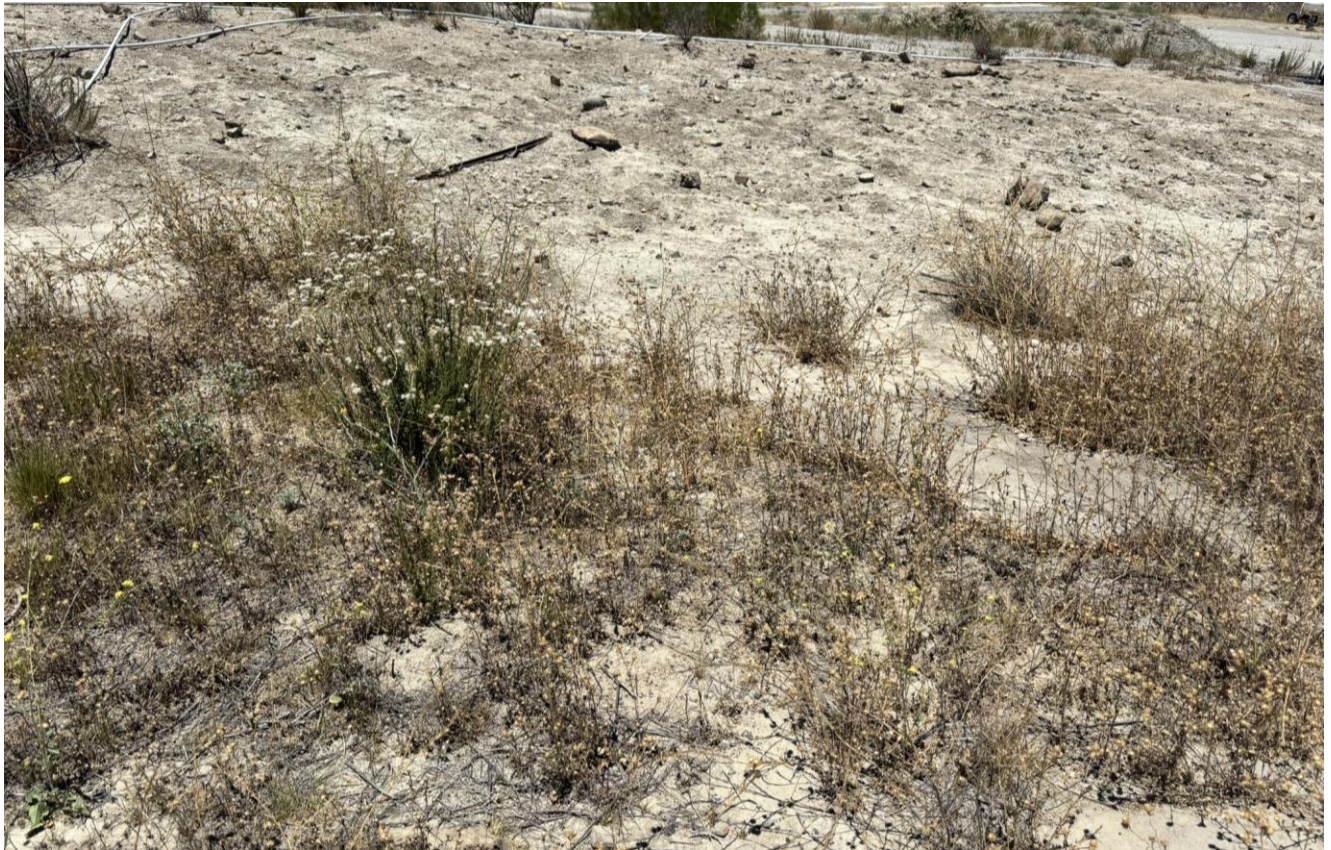
Invasive Shortpod Mustard ( Hirschfeldia incana ) and Yellow Star Thistle ( Centaurea solstitialis ) actively growing near California Buckwheat ( Eriogonum fasciculatum )