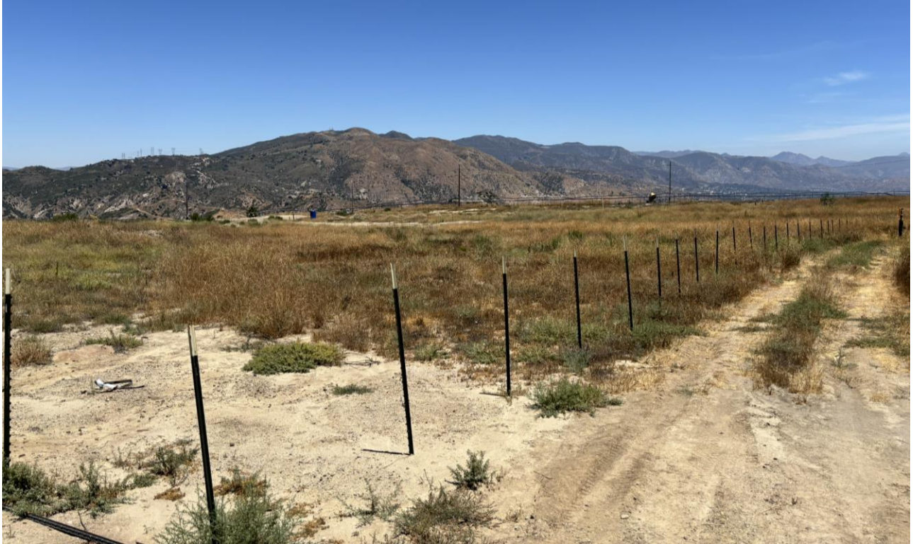
Deck A graded fill site, predominately covered with invasive weeds