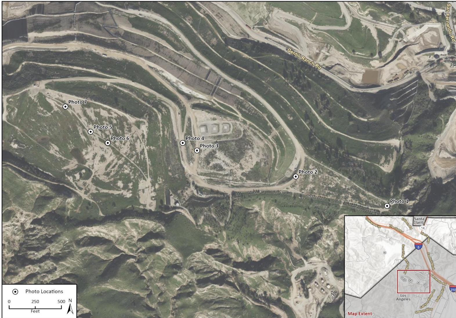
Figure 1 Photograph Locations

Photo Locations have been georeferenced and are approximate locations.