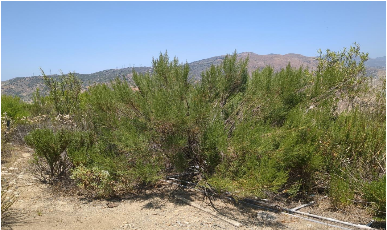
Photograph 2. Quadrat B facing northeast from southwest corner (June 23, 2025).