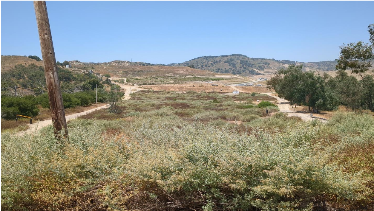
Photograph 1. Facing west at Lower Deck. View of eastern limits dominated by Atriplex spp. and California sunflower (June 23, 2025).