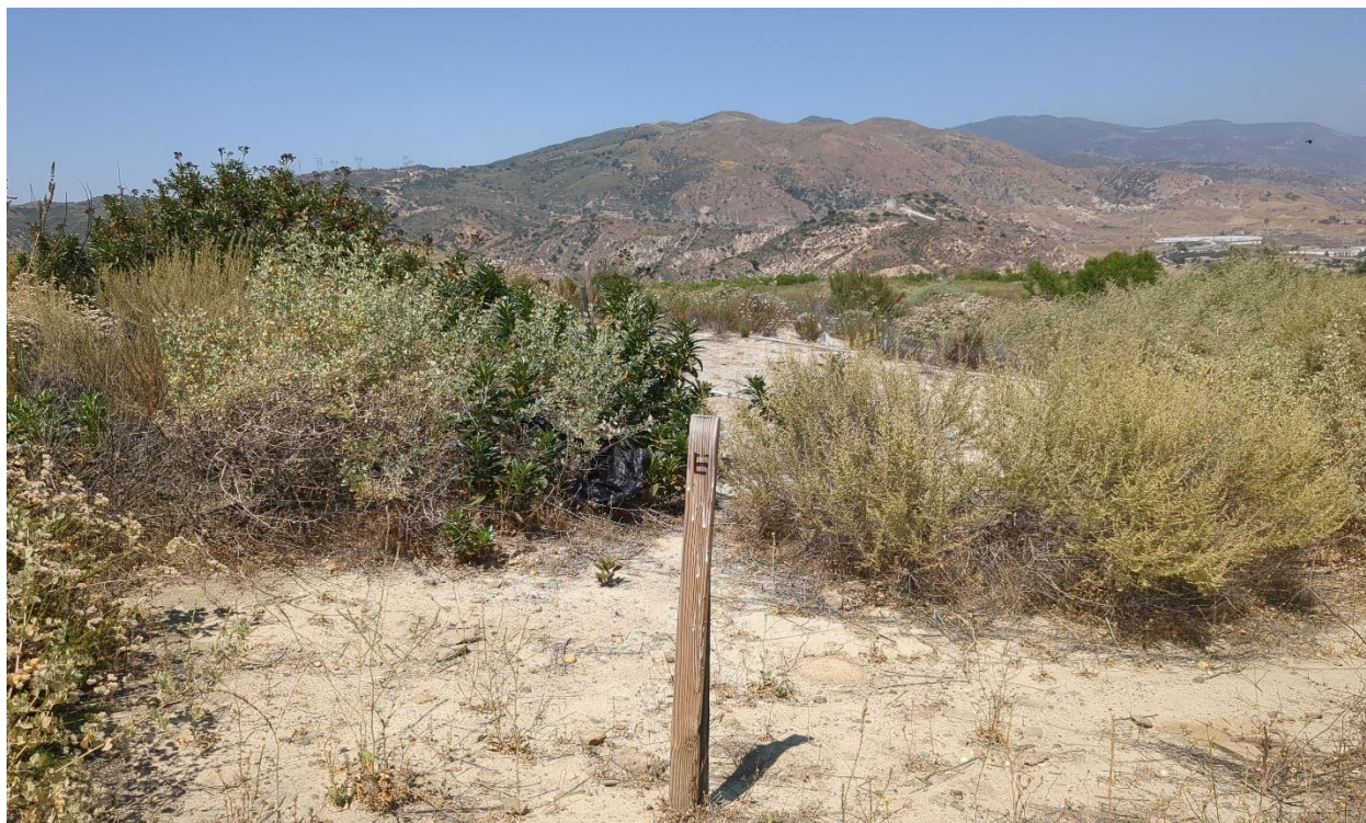
Photograph 5. Quadrat E facing northeast from southwest corner (June 23, 2025).