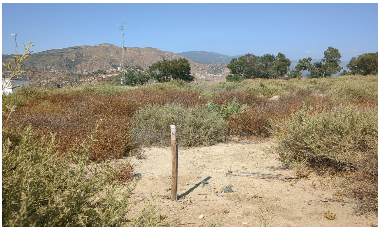
Photograph 5. Quadrat E facing northeast from southwest corner (June 23, 2025).