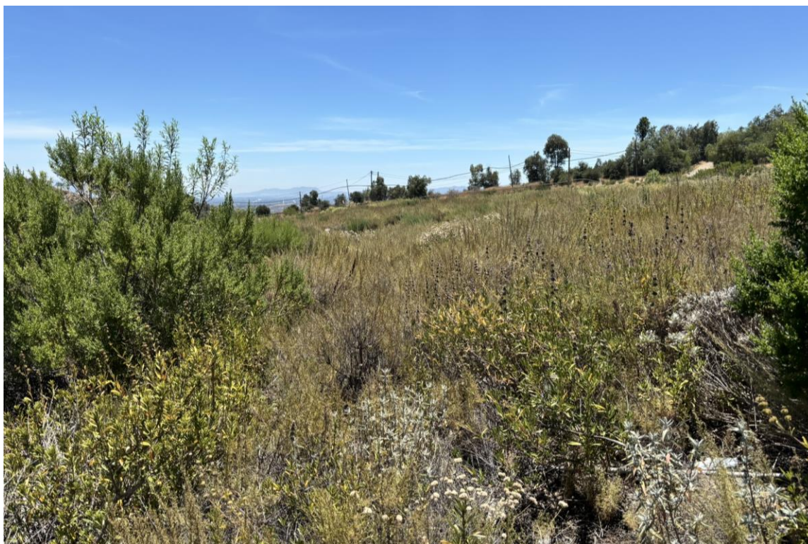
Healthy stand of Venturan CSS species growing on Deck B

ARCHITERRA DESIGN GROUP 10221-A TRADEMARK STREET, RANCHO CUCAMONGA, CA 91730 Phone (909) 484-2800, Fax (909) 484-2802